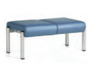
GC4132 Two Seat Bench