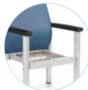
Perma-Mesh™ Suspension with 2" steel frame

Global - Canada The Global Group, 1350 Flint Rd., Downsview ON Canada M3J 2J7 Sales & Marketing: Tel (1-877) 446-2251 Customer Service: Fax (800) 361-3182 Government Customer Service: Fax (416) 739-6319