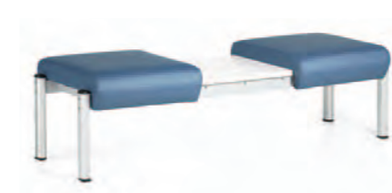
GC4134CT Two Seat Bench, Center Tablet