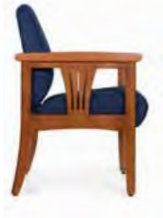
Fluted Open Wood Arms