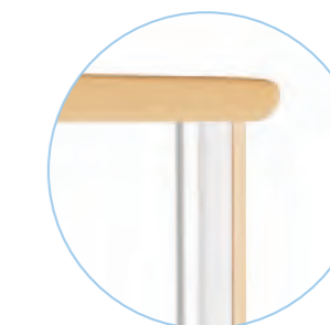
Wood Armcap, Wood Front Leg Cap