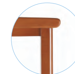
Wood Armcap, Wood Leg