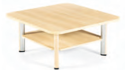
GC4108SMR Square Magazine Table in Avant Maple (W358)