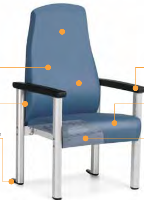
GC4101 High back chair with arms Shown in Lustre (LU11) Azurite Vinyl

Please refer to the Interlock Price List for sample configurations and a listing of the complete Interlock Series product line.