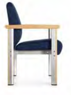
Wood Arms / Wood Front Leg Cap