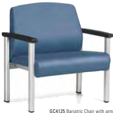
GC4125 Bariatric Chair with arms

The Bariatric model accommodates people up to 750lbs. A wider seat and heavy duty durable frame provides exceptional support and comfort. It can be used as a stand alone chair or it can be linked to other table or chair components.