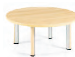
GC4108C Round Table in Avant Maple (W358)