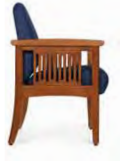
Linear Open Wood Arms