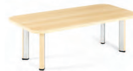
GC4109R Rectangular Table in Avant Maple (W358)