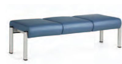
GC4133 Three Seat Bench