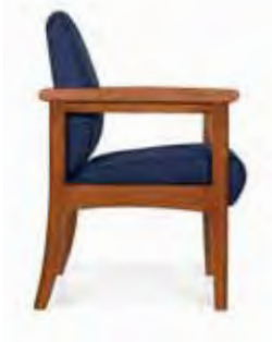
Open Wood Arms