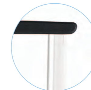
SSU Armcap, Silver Aluminum Front Leg Cap