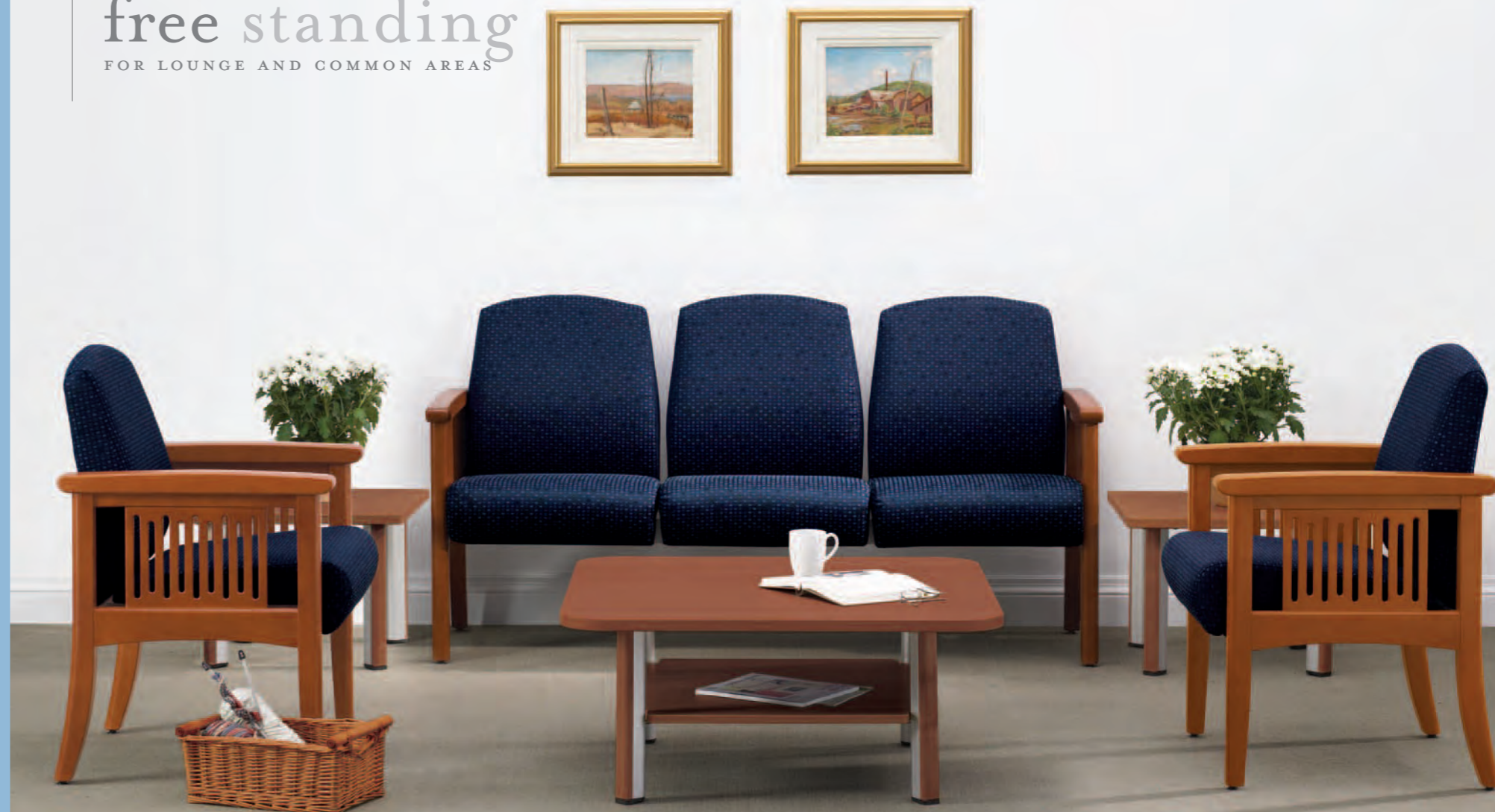
Shown in Locale (LL01) Blueberry fabric and Avant Honey (W356) finish

free standing FOR LOUNGE AND COMMON AREAS